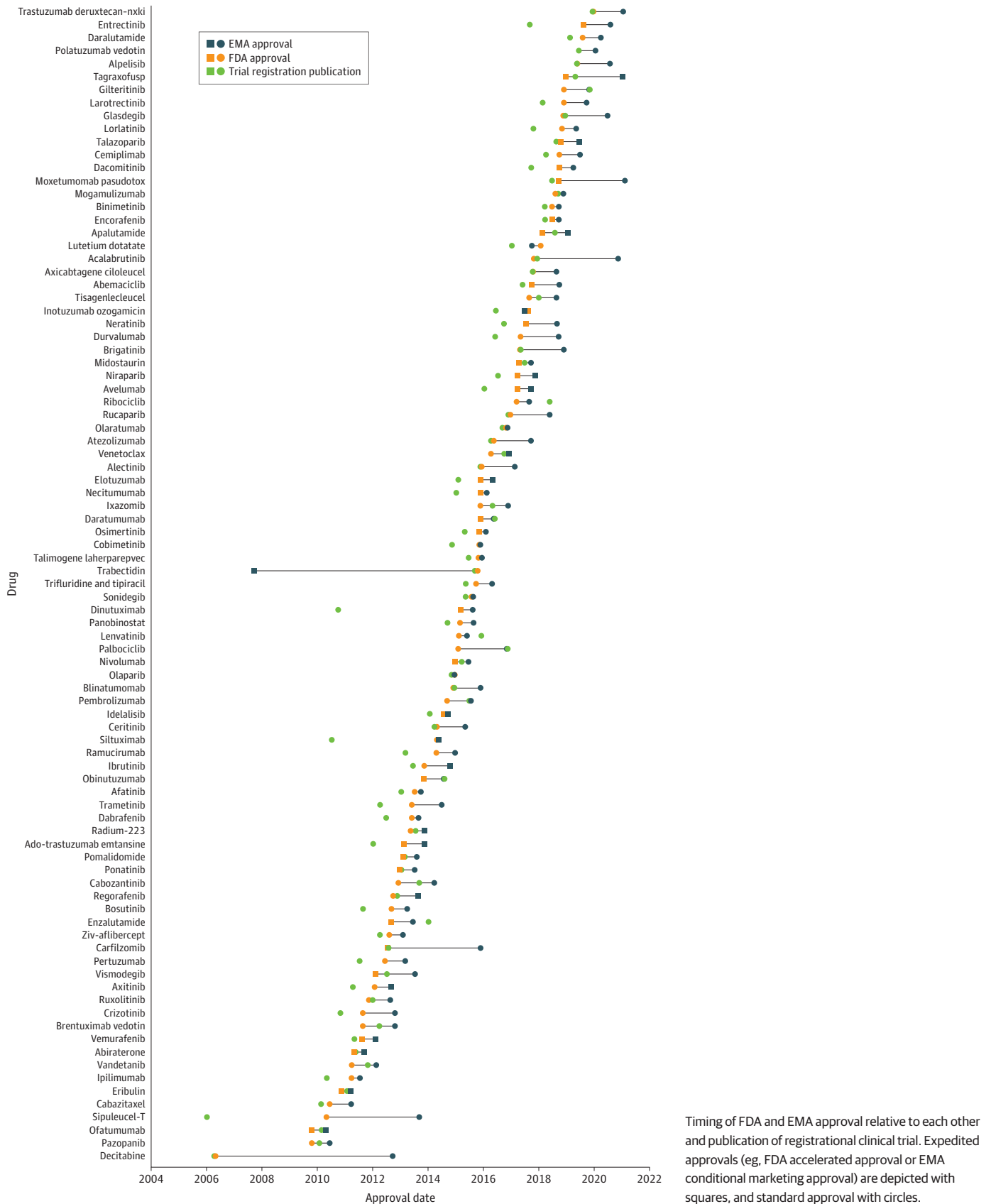
Figure 1. Timing of New Oncology Drug Approval by the US Food and Drug Administration (FDA) and the European Medicines Agency (EMA)

Timing of FDA and EMA approval relative to each other and publication of registrational clinical trial. Expedited approvals (eg, FDA accelerated approval or EMA conditional marketing approval) are depicted with squares, and standard approval with circles.