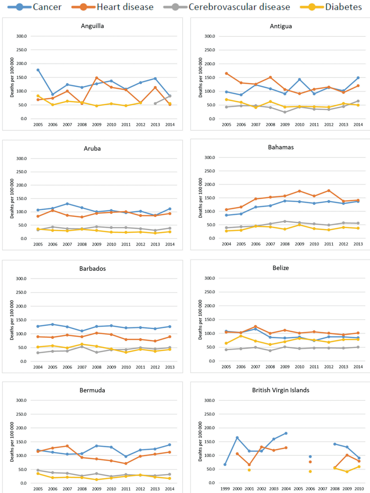
FIGURE 1. Annual age-standardized mortality rates for cancer, heart disease, cerebrovascular disease, and diabetes in Puerto Rico, the U.S. Virgin Islands, and 20 other English- or Dutch-speaking Caribbean countries and territories, 1999-2014 a