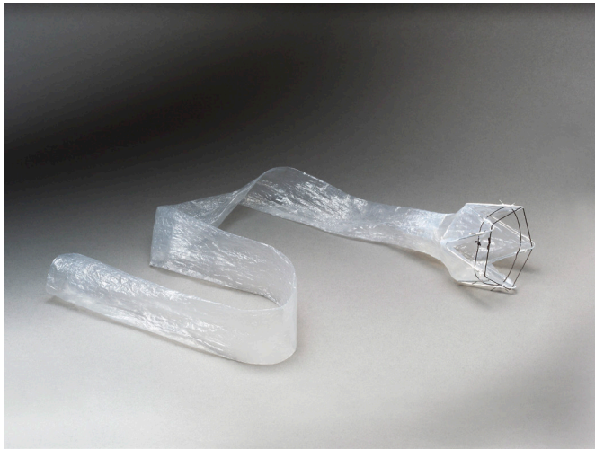
Figure 1 EndoBarrier gastrointestinal bypass liner.

an impermeable fluoropolymer sleeve that extends 60 cm through the duodenum and into the jejunum (figure 1). The implant is open at both ends to allow for passage of chyme from the stomach into the lower jejunum and prohibits nutrient absorption along its length by creating a barrier between the partially digested food and the absorptive surface of the small intestine. While the chyme passes through the inside of the EndoBarrier device, all bile and pancreatic secretions pass on the outside the liner and only mix with the food when they come into contact at the end of the sleeve.