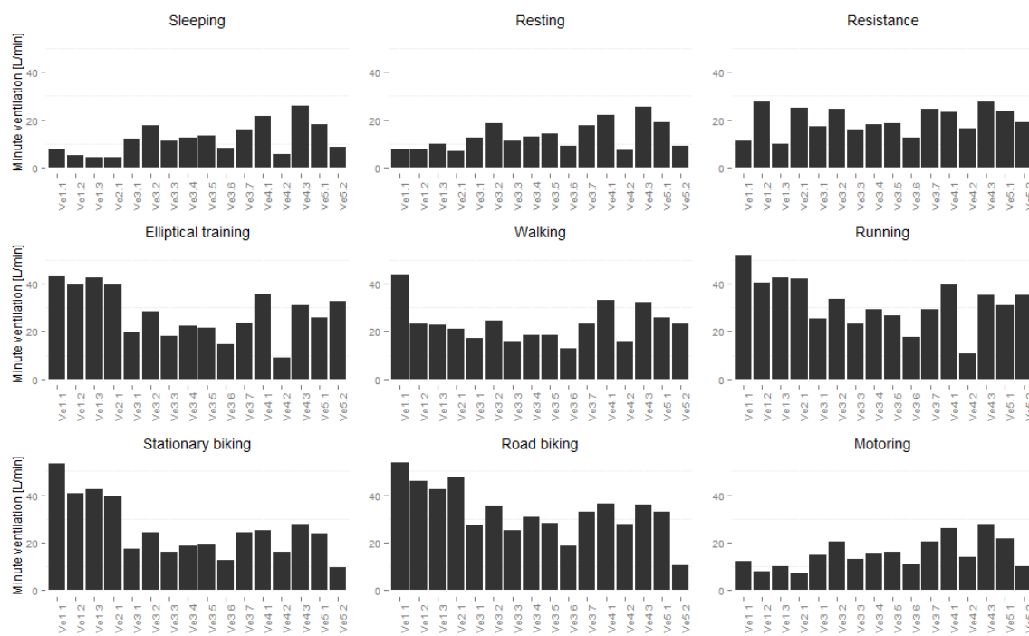
Figure 3: Comparison of ventilation estimates using 16 different formulae for different activity types and transport modes.

City or sex did not notably impact the ventilation estimates (Supporting Information Table S11), except for Ve4.2 that predicted lower ventilation in Barcelona and in males. Ventilation was slightly higher in Antwerp which can be explained by the higher share of male participants, possibly in combination with reported differences in cycling speed between the cities 12, 38, 39 . Four methods estimated higher average ventilation in women compared to men: Ve3.4, Ve3.6, Ve4.1, and Ve4.2. These were all methods that did not stratify between sexes, or did not include a variable like height, weight or FVC.