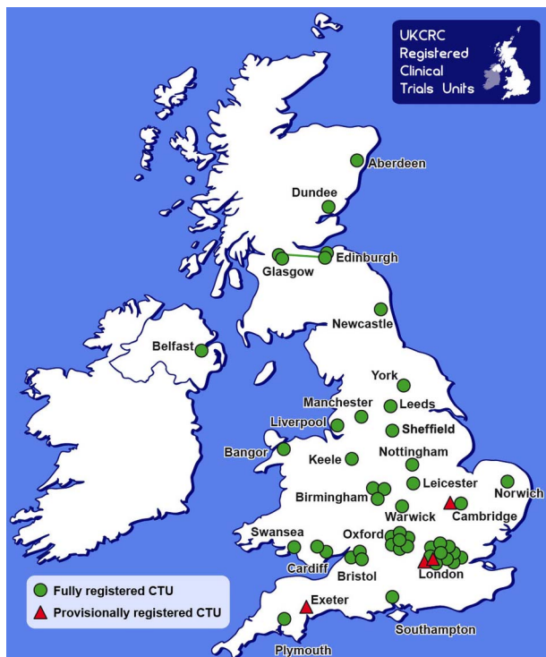
Figure 1 Map of the UK Clinical Research Collaboration (UKCRC), registered clinical trials units (CTUs).