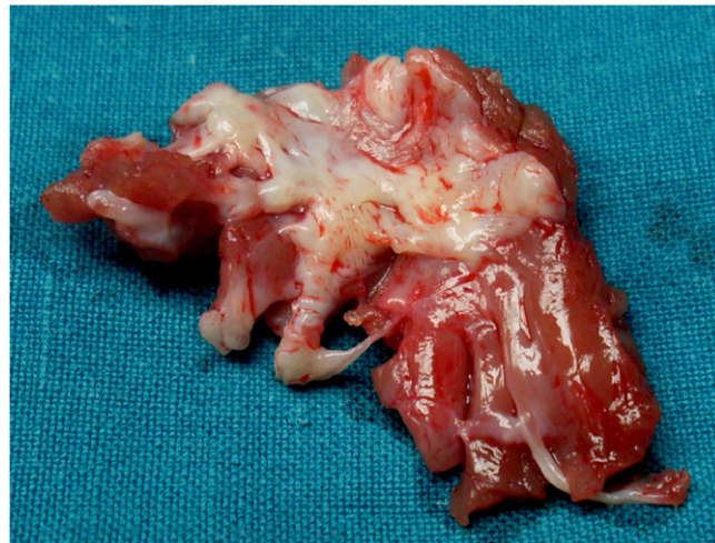
Figure 1. Myectomy specimen illustrating the extent of the resected muscle which includes the area of subendocardial fibrosis on the septum and three muscle bands extending into the midventricular region.