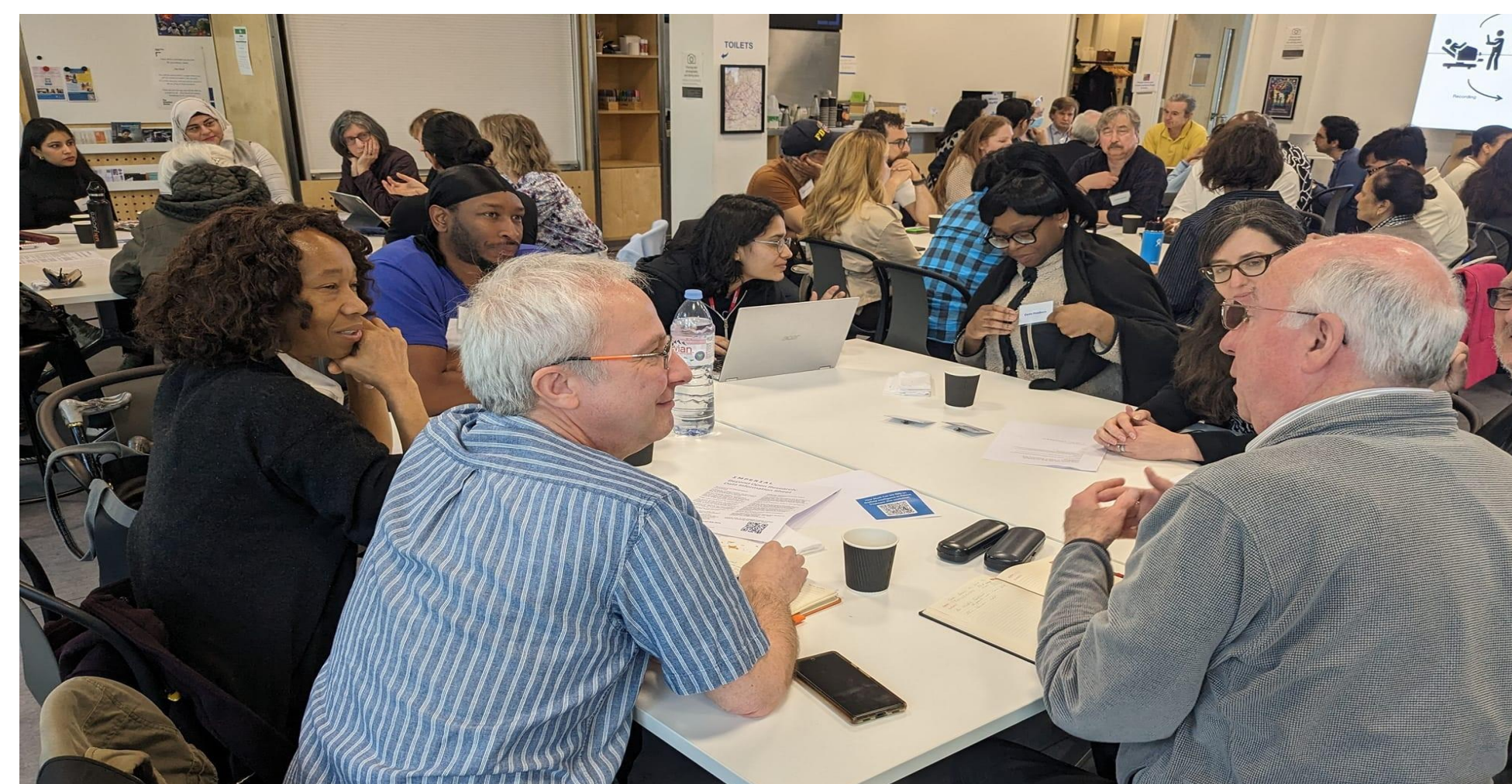
Public involvement has been a novel part of this work. Societal views of research culture are poorly explored, but to embed responsible research practices, it's crucial to understand what it's all for. Workshop participants discuss their questions and concerns about the reliability of Artificial Intelligence in patient treatment (The Invention Rooms, Imperial College London, 9 May 2024). The participants were a combination of patients, clinicians and interested members of the public.

In a series of facilitated scoping and co-creation workshops, we are engaging with: