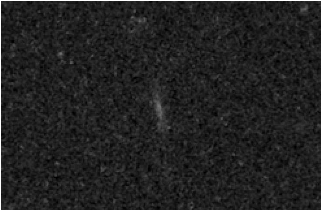
Figure 1. STIS clear CCD image of the host galaxy of SN1996cf.

. The pixel size in this the standard STIS CCD resolution of 0.05'' . The Image is 15'' \times 11'' in size, ie. 300 \times 220 pixels.